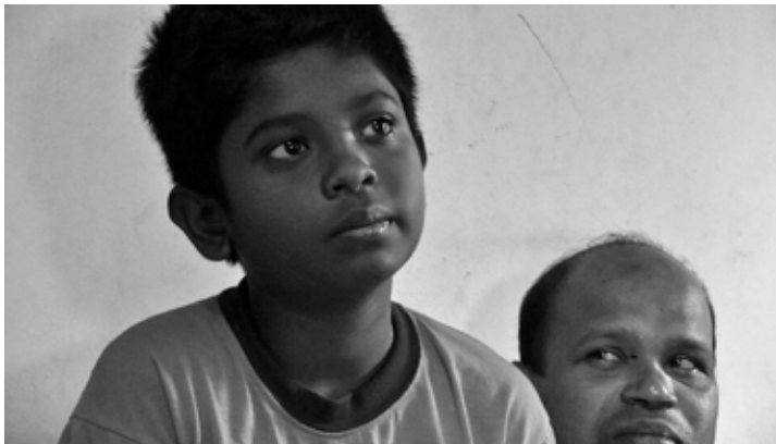
A Sri Lankan family was forced to leave their country after which they were detained and the children and there father were seperared from the mother in detention.