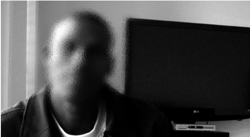
Sudanese boy who was detained in Malta at the age of 16

Refugee, asylum seeker and irregular migrant children need the means of material survival. They need the capacity to meet their daily nutritional requirements and to be adequately clothed. This is consistent with Article 27 of the Convention on the Rights of the Child noted above, which stipulates that children have a right 'to a standard of living adequate for the child's physical, mental, spiritual, moral and social development.' 154 The capacity of states to deliver adequate means of material support will differ. Where capacity is limited, the Committee on the Rights of the Child has specified that states should 'accept and facilitate the assistance offered by UNICEF, UNESCO, UNHCR and other United Nations agencies within their respective mandates, as well as, where appropriate, other competent intergovernmental organizations or non-governmental organizations (art. 22 (2)) in order to secure an adequate standard of living for unaccompanied and separated children.' 155