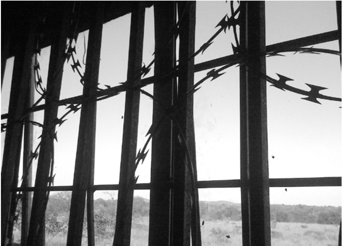
Immigration detention centre in Musina South Africa