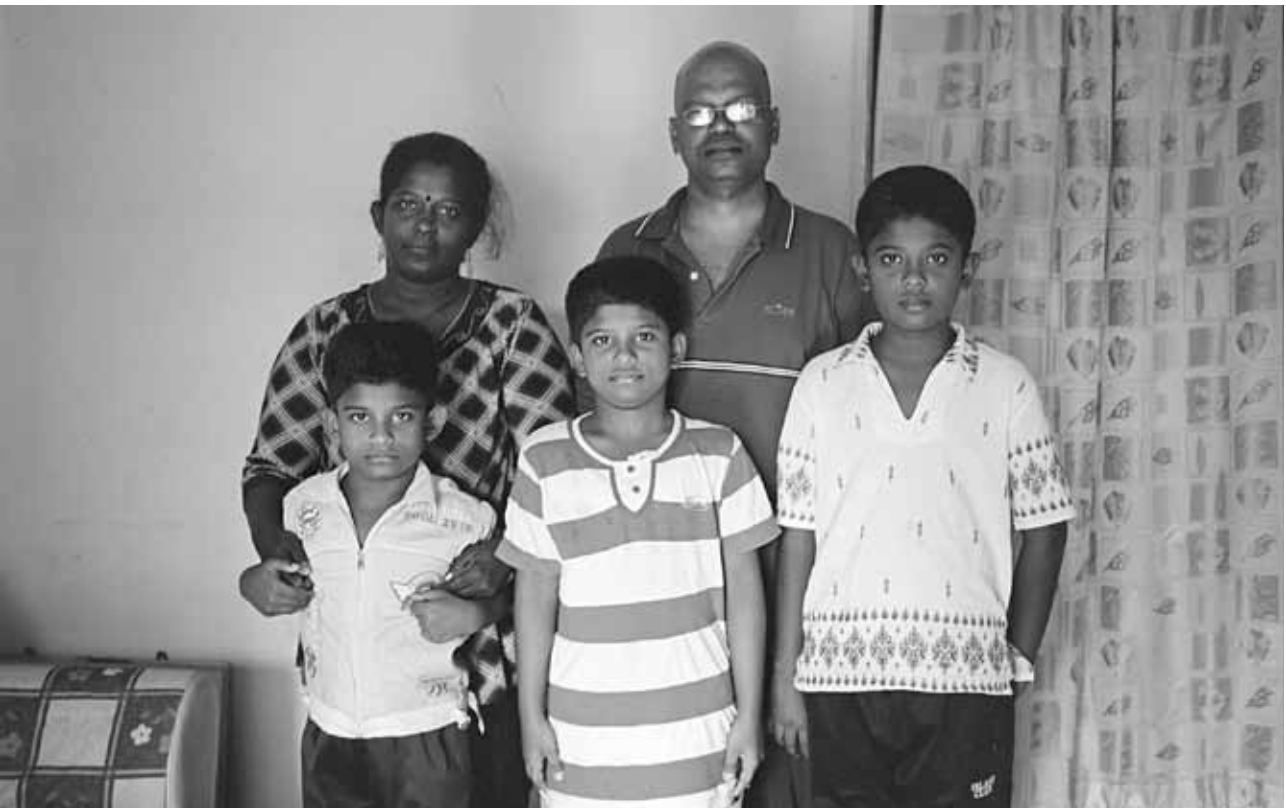
A Sri Lankan family was forced to leave their country after which they were detained and children and the father were separated from their mother.