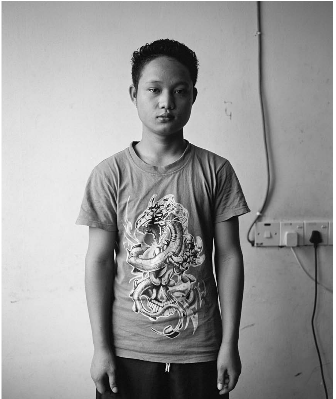
A Burmese boy detained for a month after fleeing his home