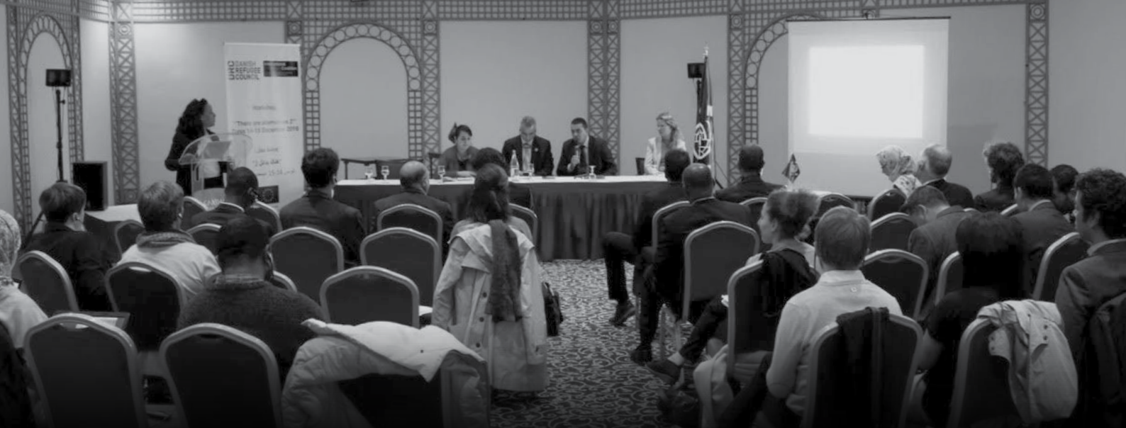
Libyan civil society and government representatives at the Alternatives to Detention Workshop 15 and 16 December, Tunis