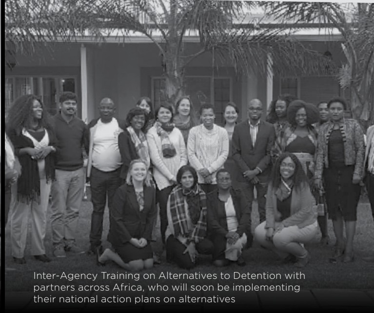
Inter-Agency Training on Alternatives to Detention with partners across Africa, who will soon be implementing their national action plans on alternatives