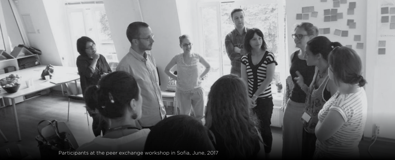
Participants at the peer exchange workshop in Sofia, June, 2017