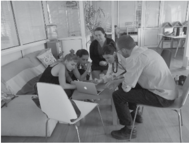
Participants at the Alternatives to Detention peer exchange workshop in Sofia, June, 2017

In Africa, an IDC Staff delegation visited South Africa, Zambia, Malawi and Botswana between April 24th and May 14, discussing alternatives to detention in the region and how States could enact their 2016 Migration for Southern Africa Dialogue (MIDSA) commitment to implement alternatives to detention, especially for children. In each country, the IDC met with members, supporters, UN agencies and Governments about positive practice in the region and ways that these practices can be expanded.