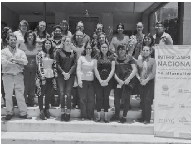
Stakeholder workshop evaluating implementation of alternatives to detention in Mexico, July 2017

This year, the challenge was to harness this significant momentum in Mexico, looking to utilize insights gained to achieve meaningful change. Here, we document our multi-pronged approach to expand and formalize the use of alternatives to detention.