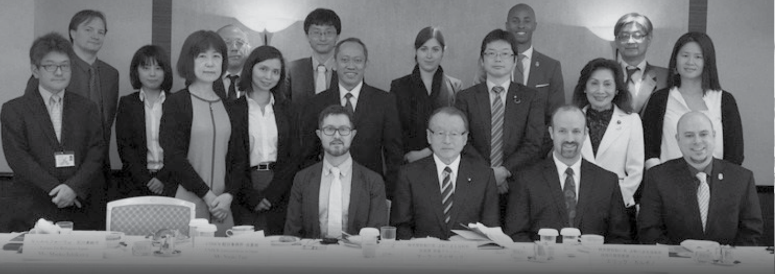
A delegation of experts collaborated with experts in Japan to explore alternatives to immigration detention - in this picture, delegates with the Members of the Diet of Japan