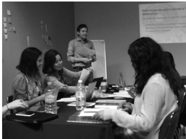
Mexican stakeholders participate in a specialized workshop on advocacy about alternatives to detention, Mexico City, August 2016

We also shared this good practice knowledge and facilitated dialogue and exchange on ATD implementation among key stakeholders via meetings with representatives from the National Migration Institute (INM), Federal Child Rights Protection System (SIPINNA) and UNHCR. We conducted training with operational staff at the Mexican Refugee Commission (COMAR) and for members of the National Human Rights Commission (CNDH). We collaborated with key civil society partners to facilitate a workshop on ‘Care for Migrant Children in ATDs’ for staff at the first government-run reception space for asylum seeker children in Mexico: Albergue ‘El Colibrí’, in Villahermosa, Tabasco. The reception space marks yet another government-led initiative to develop alternatives that was informed by the success of the pilot.