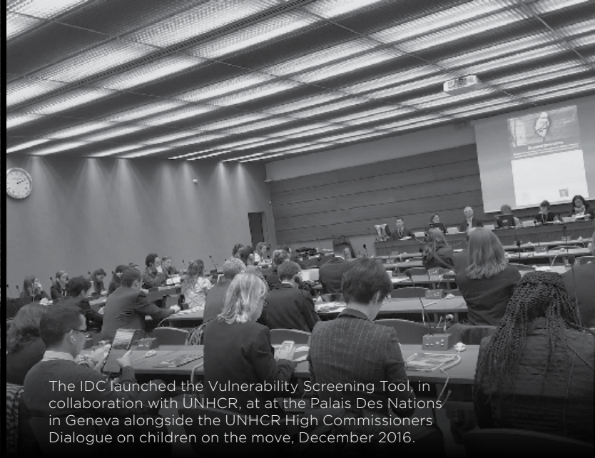
The IDC launched the Vulnerability Screening Tool, in collaboration with UNHCR, at the Palais Des Nations in Geneva alongside the UNHCR High Commissioners Dialogue on children on the move, December 2016.