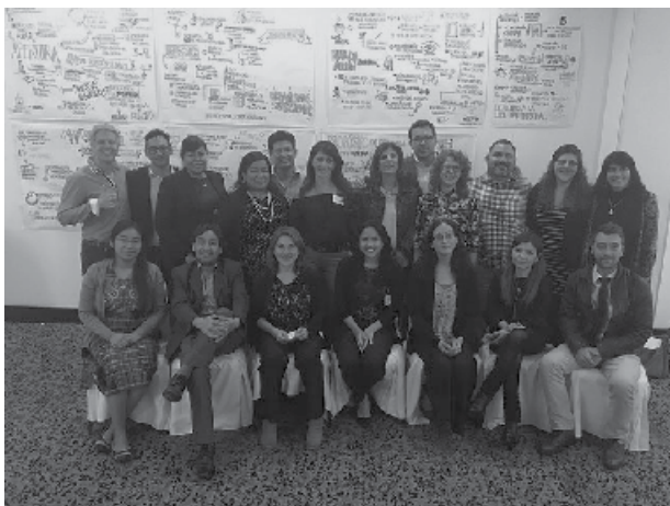
Participants at the Regional Dialogue, April 2017