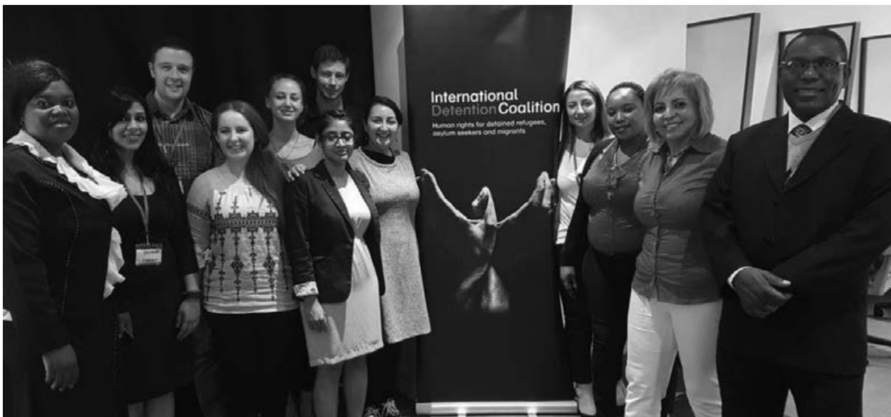
Alternatives to Detention Implementer Workshop, Lusaka, Zambia, May, 2017