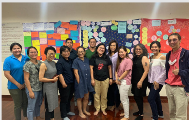
Theory of Change workshop with IDC partners in Thailand, September 2020

IDC would like to thank our members and partners around the world for their continuing support during this year. Special gratitude goes to members of IDC's International Advisory Committee and the IDC Committee, who give of their time so generously and enable us to make our collaborative efforts effective and global in scope. Additionally, many of our partners do not sit on formal IDC member committees, however their generosity and commitment to collaboration enables IDC's network to achieve far more than any single organisation could. Thank you all for your vision, energy and willingness to share your knowledge.