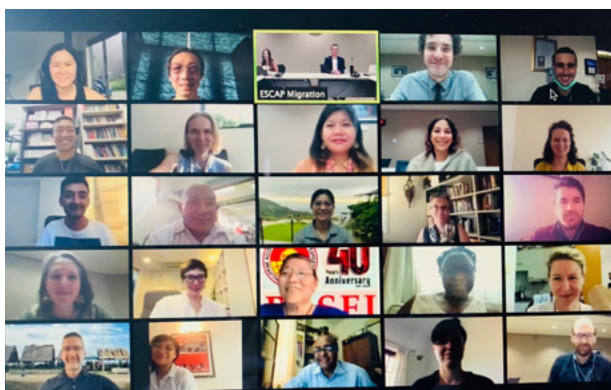
IDC staff co-lead discussions at Asia Pacific stakeholder consultations for the GCM, November 2020

Since its inception, IDC has prioritised the development of communities of practice. These peer-learning processes facilitate the sharing of ideas, experiences, knowledge, challenges, as well as encourage ongoing support among stakeholders. In furthering our solutions-focused approach, IDC facilitated key peer-learning exchanges among IDC members and partners cross-regionally and globally this year.