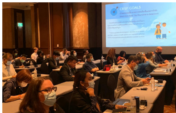
CRSP Annual General Meeting, December 2020

agencies, INGOs, UN agencies and diplomatic missions, in particular the Canadian Embassy in Thailand which has increased its support for these initiatives in the last period as well.