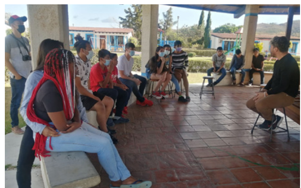
IDC and partners engaging children with lived experience of migration and detention in Mexico

Additionally, IDC collaborated with IMUMI and SOS Children's Villages in Mexico and Central America to facilitate dialogues with children with lived experience of migration and detention, with the aim to promote their leadership and develop tools for advocacy. IDC provided technical advice on ethical participative assessments and methodology.