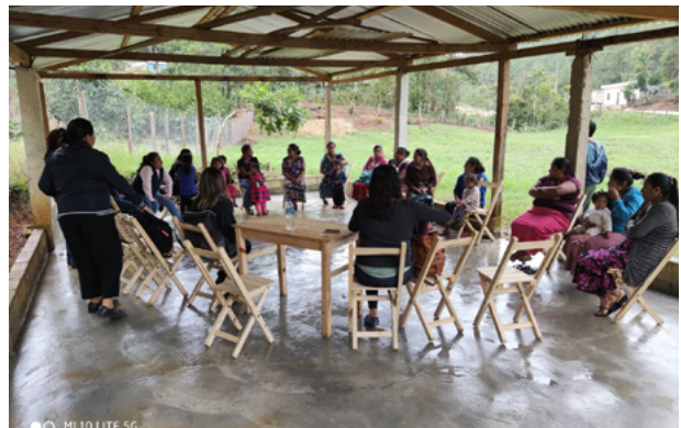
IDC and partners engaging stateless border communities in Mexico

We continue to be committed to providing our members with the support, tools and technical expertise they need to further advocacy to end immigration detention. See our members showcased here , and become a member here .