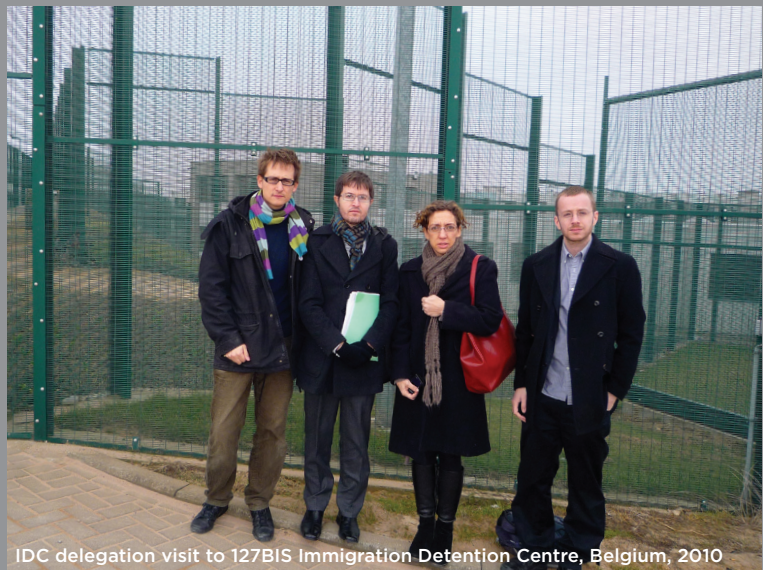
IDC delegation visit to 127BIS Immigration Detention Centre, Belgium, 2010

"At the roundtable on alternatives to detention in Seoul with the IDC, we had the very first discussion with the Japanese government on alternatives to detention. Some progresses in practice: The immigration started to release many detainees. No asylum-seeker children in detention now. We proposed the government start to have a regular meeting on alternatives to detention." Japan Association for Refugees (JAR), June, 2010