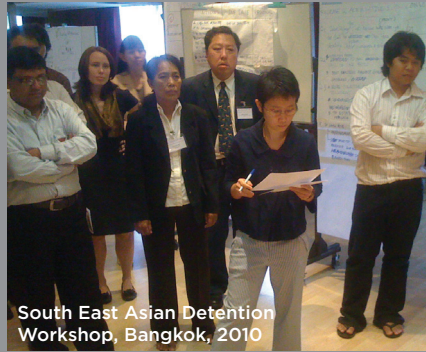
South East Asian Detention Workshop, Bangkok, 2010

"Thanks to the IDC for all the work you are doing. It feels good to have friends to share concerns regarding detention. Up until our meeting I have felt very alone indeed. Now I can share with many." IDC member in Asia