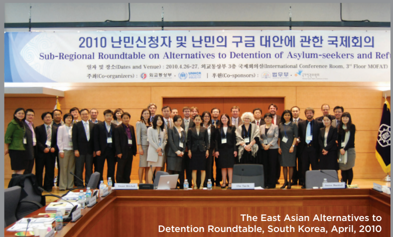
The East Asian Alternatives to Detention Roundtable, South Korea, April, 2010

“I don’t think I can tell you enough times how incredibly impressed I am by what you’ve managed to achieve in the way of improving detention practices in the region.” IDC member in the Americas